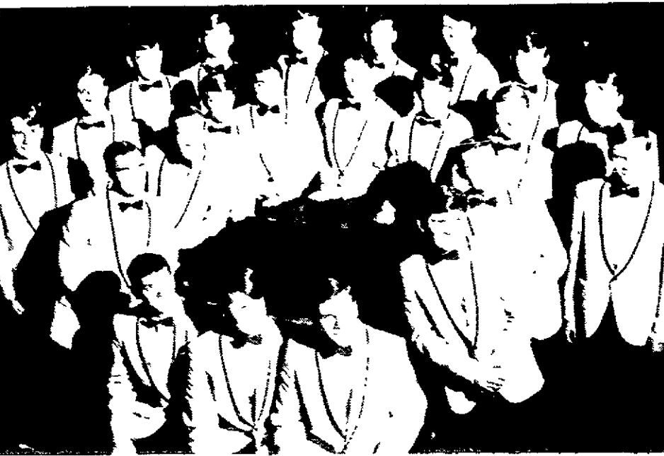
Mount St. Mary's Glee Club