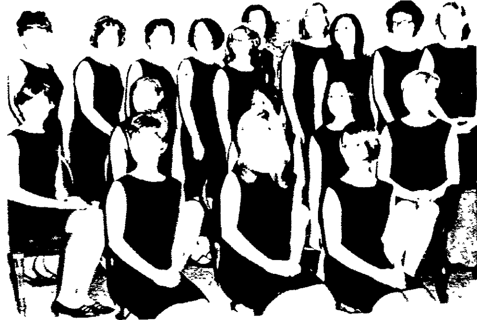
Ohio Dominican College Choraliers